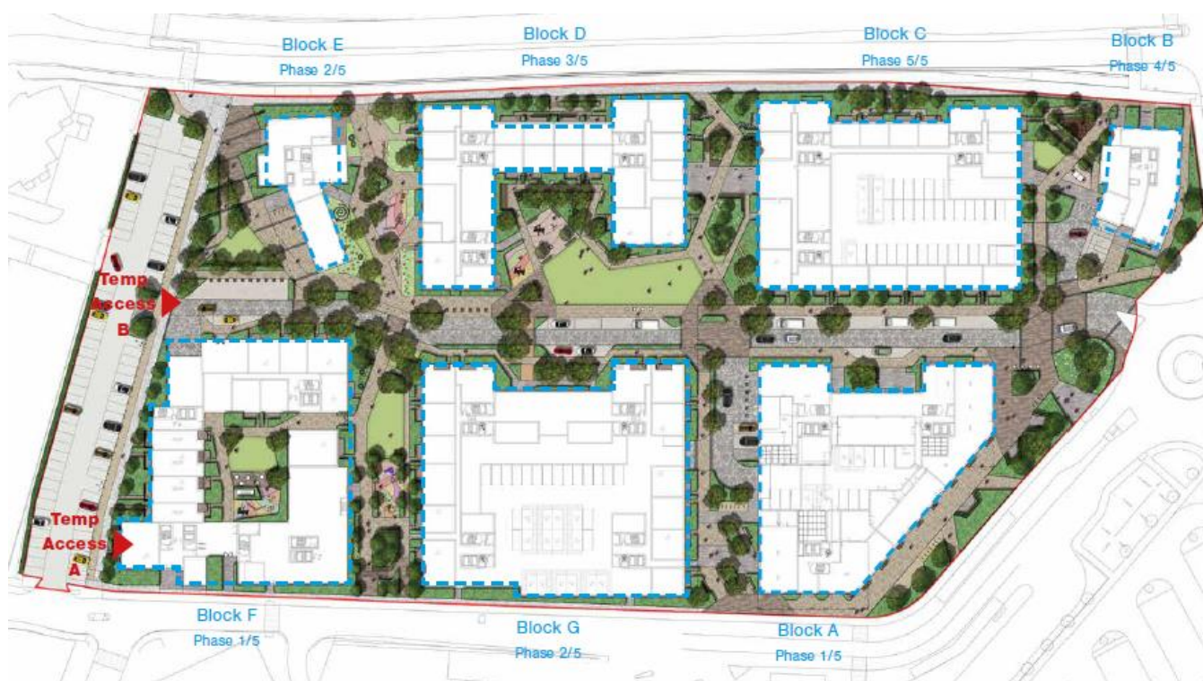
Fig 1: Phasing Plan